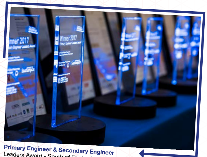
Primary Engineer & Secondary Engineer Leaders Award - South of England 2017 trophies

These letters provide teachers with the opportunity to explore: